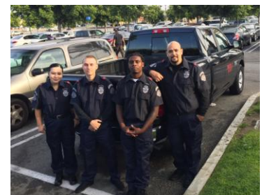
ALLIED Security Officers at one of Our Recent Wal-Mart Launches

With this expansion ALLIED brought on quite a few new staff, who we welcome to the ALLIED Team!